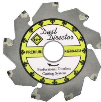
Joint Sealant Cutters

For use on variable speed Hand-Held Angle grinders (6,000 Rpm setting).