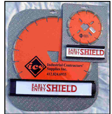
Patented Plastic Skid Plate Shield - included with each blade.

Colored Coded Blades. Maximize Life & Cutting Speed - for different aggregates across the country.