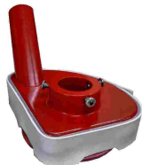
5" Surface Corner Dust Guard

Corner Guard design allows grinding and polishing into a corner with no dust problem as easily and tightly as if there was no shroud at all.